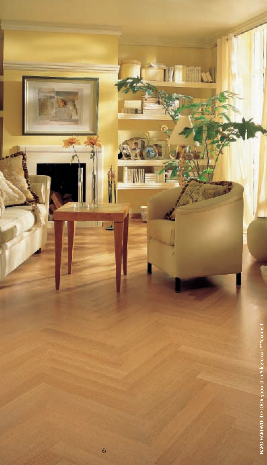
HARO HARDWOOD FLOOR 4000 strip Allegro oak ***exquisit