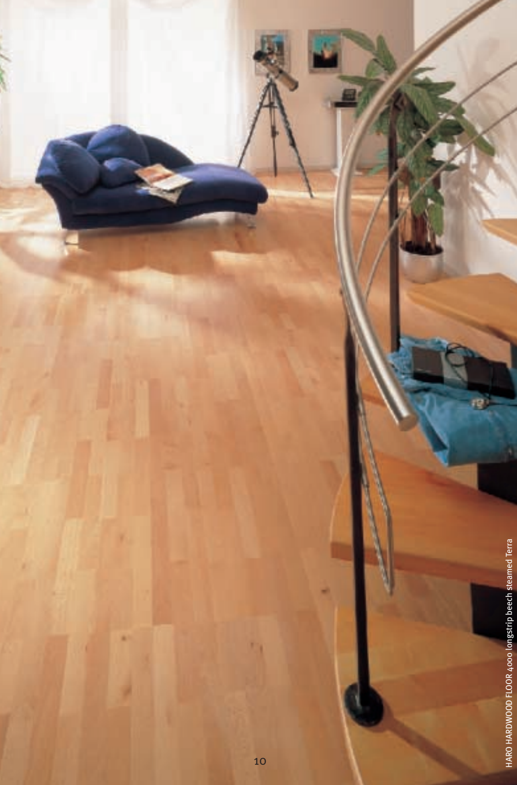
HARO HARDWOOD FLOOR 4000 longstrip beech steamed Terra