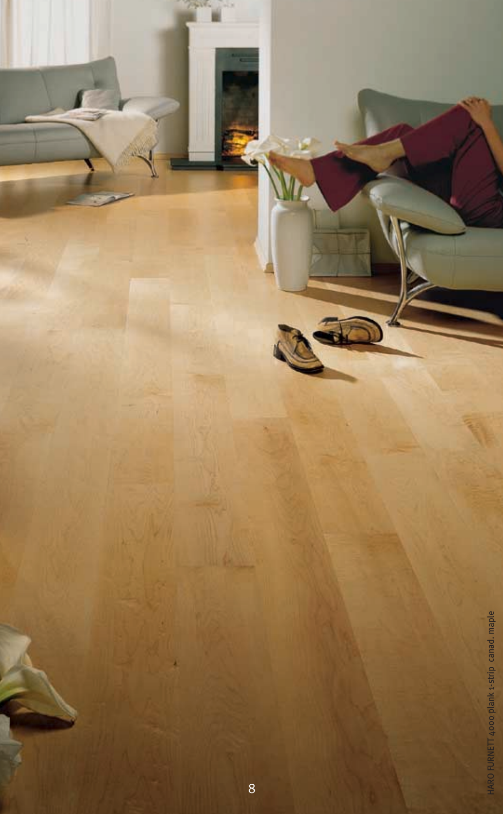
HARO FURNETT 4000 plank 1-strip canad. maple